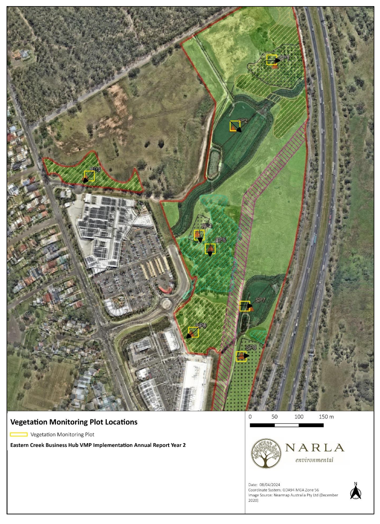
Figure 1. Photo Points and Direction Photo Taken