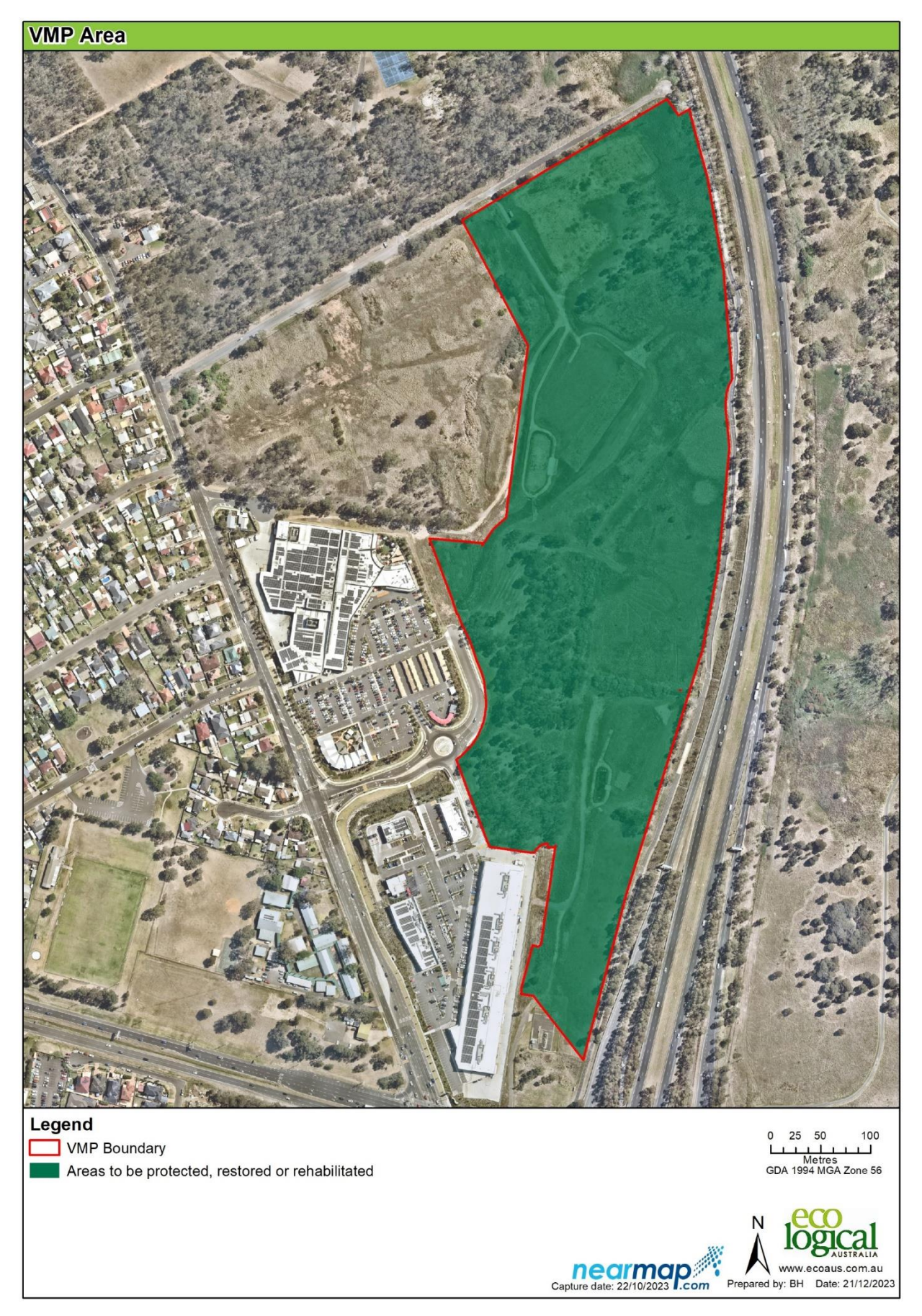
Figure 1: Proposed VMP Area boundary as depicted in Version 9 of the VMP (ELA 2024)